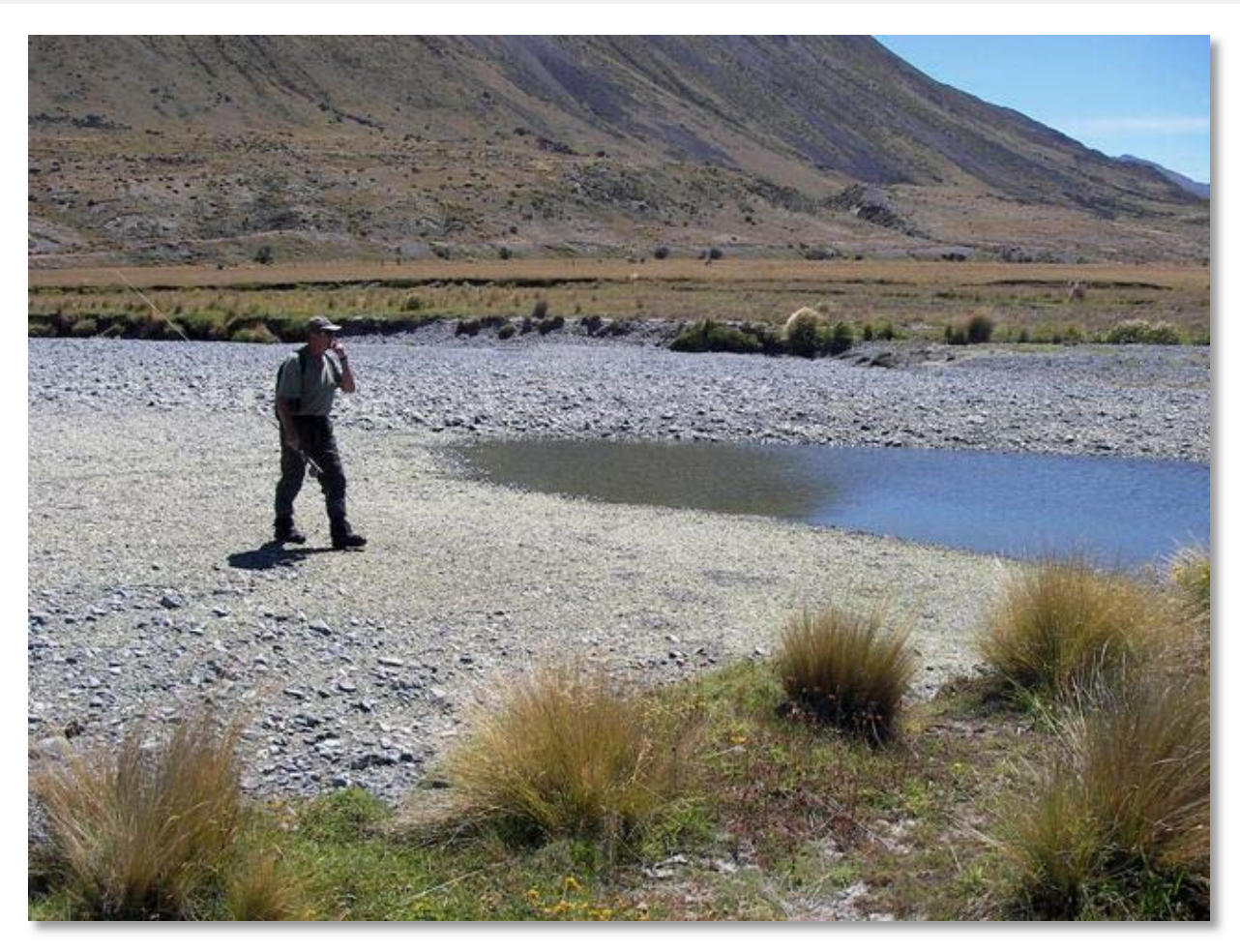
A photo of the Mararoa River above Boundary Hut where it was completely dry recently. Who stole the river?