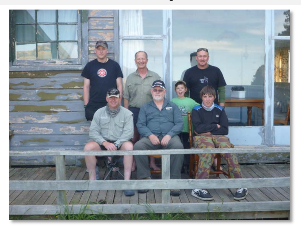
A photo from a lodge visit from February 2013