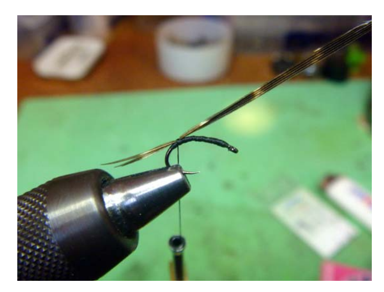
Step 1 Tie in some pheasant tail and trim off excess.