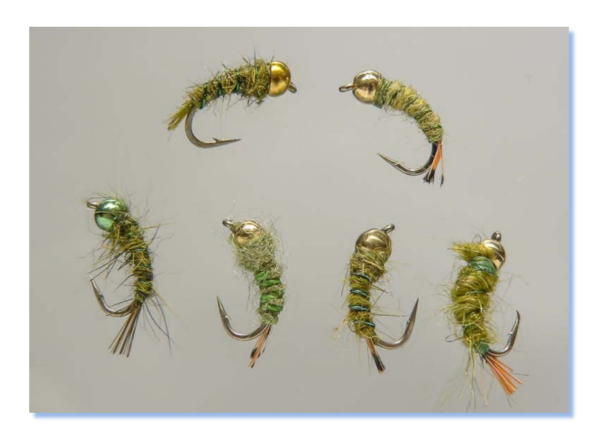
There were 6 flies entered in the July competition