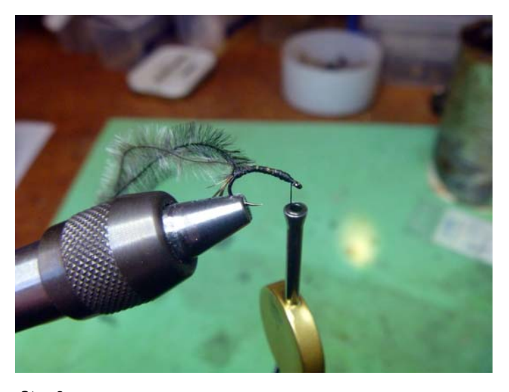
Step 2 Tie in 2 strands of ostrich herl and wind on to the front of the hook