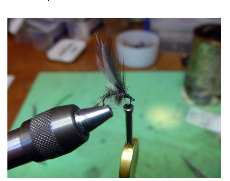
Step 3 Tie in a hen hackle and wind on for three turns and tie off and cement the head