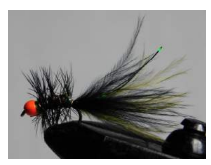
Tie in the body hackle at the