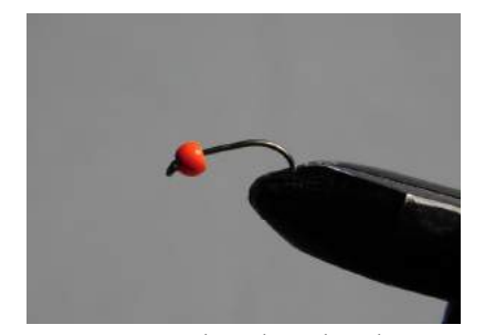
Orange bead on hook