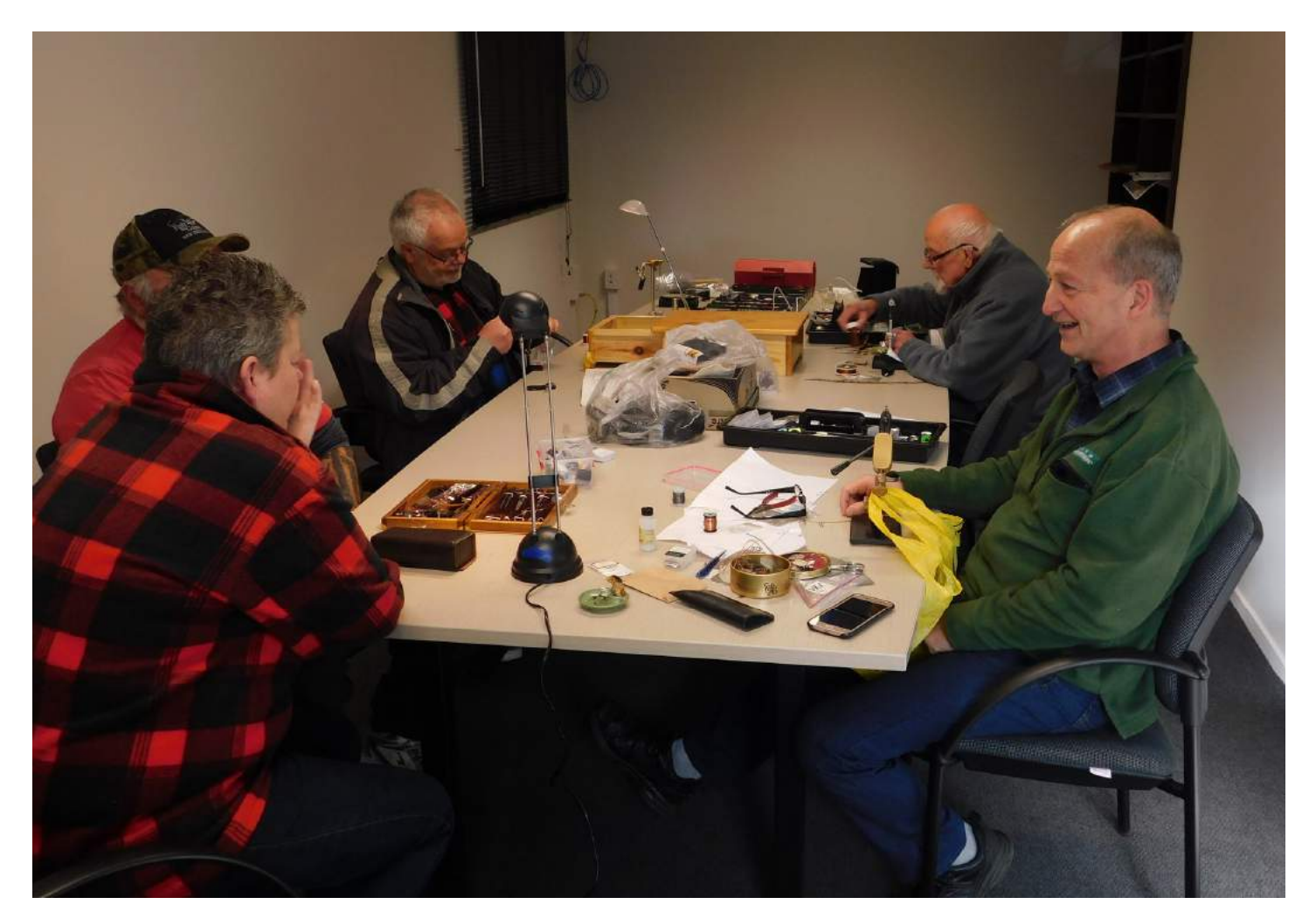
August Monthly Meeting - 28th August 7:30pm at Hunting & Fishing, Leet Street.