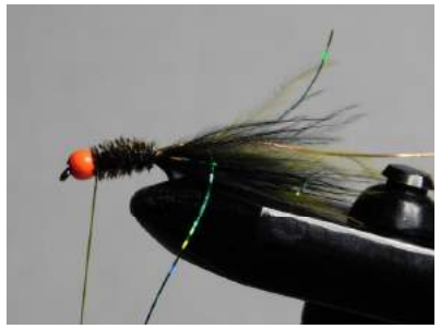
Tie in peacock herl using tip end, as they get slightly bigger as you work up the shank towards the butt end. This gives you a slight taper.

Tie into tail a few olive marabou tail feathers and tie in copper wire.