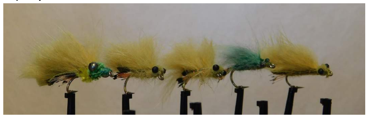
July fly competition entries