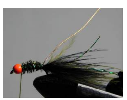
Wind the flash forward.