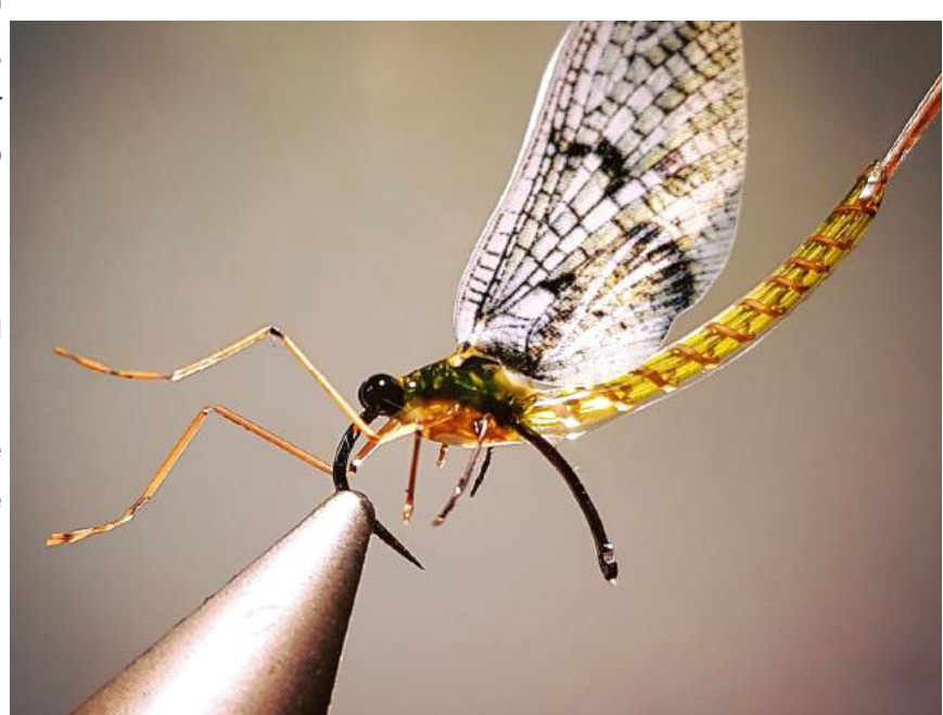
Nice photo and fly tied by Peder Wigdell

"It has been too timid and avoided the hard issues it is supposed to be there to tackle."