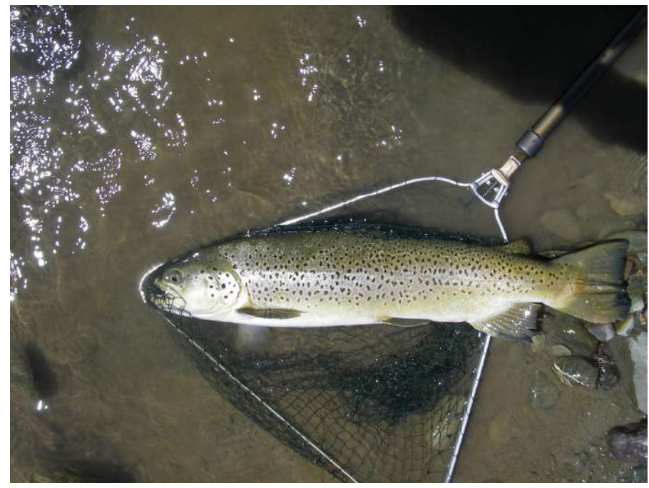
Best fish of the trip – 61/4lb brown

nymph and was gone. The cloud was starting to break up so it looked like spotting would improve but the wind was starting to come up a bit. I continued to catch a few fish with a good rainbow of 4½lb coming to the net as well as a couple of 2lbers that weren't in great condition. The second of these got itself well and truly tangled with my tippet around most of its fins. This somewhat disabled it and it was easy to get to the net. A bit further up I spotted what looked like a nice fish in shallow but fast water and it took my nymph. For a change it was a brown and it tipped the scales to 61/4lb. It was really easy to land after the fighting rainbows. A couple more rainbows and it was time to turn back to the car that was 6.5km away. Tally for the day was 8 rainbows and 1 brown so I was happy.