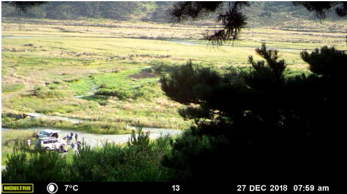
Figure 3: An example trail camera photo of the Windley, Windley River and Gravel Pit Beat showing anglers parked at beat carparks.