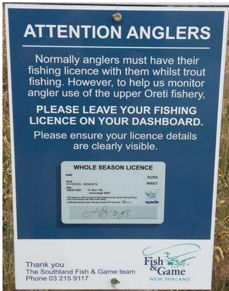
Figure 4: Instructional signage used to help monitor the origin of anglers on the upper Oreti.