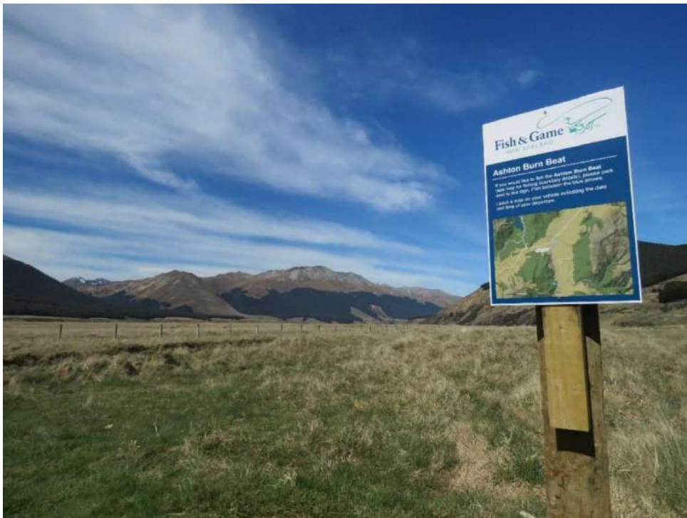
Figure 2: An example of a fishing beat sign.

When processing the trail camera photos, a beat was deemed occupied on a given day if an angler parked next to the beat sign (regardless of how long they fished for). The time in which they arrived and left the beat was also recorded. This provided the metric Beat Occupancy as a measure of angler use. Beat occupancy rates by month and fishing season were then collated for comparison.