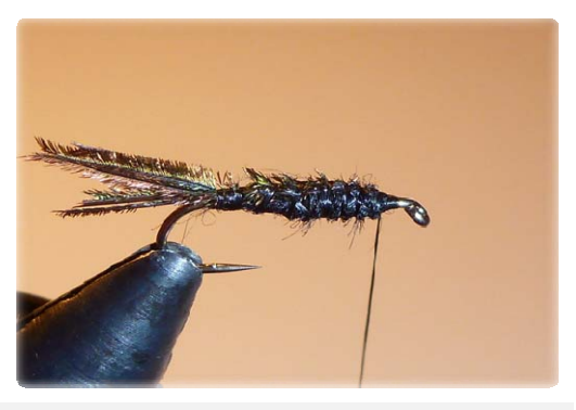
[Step 4] Select 4 or 5 Peacock swords / herls and tie in to form a tail, length just short of a shank length. Wrap forward and trim off the excess.