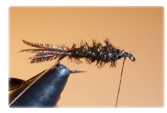
[Step 7] Wrap the herl forward and tie off about an eye length behind the eye. Clip off excess.