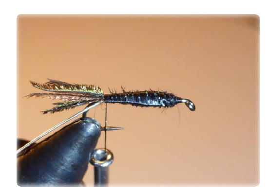
[Step 5] Tie in silver wire, wrapping back to tail, return the thread to the front of the under body.