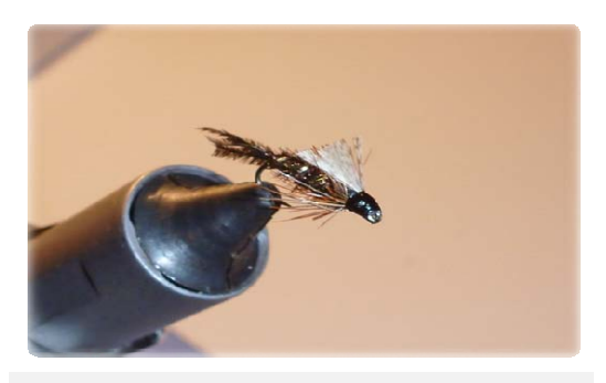
[Step 10] Clip the mallard feather straight across at the midway point along the shank. Add a coat or two of cement to the head and you're done. Note: Be careful to maintain a space behind the eye early on and minimise the number of wraps behind the eye to avoid an excessively large head, (like I did on this one...)