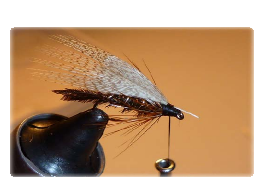
[Step 9] Strip the fibres from the mallard feather and tie in as shown. Clip the mallard stem and build a short head to cover the stub. Whip finish and clip thread.