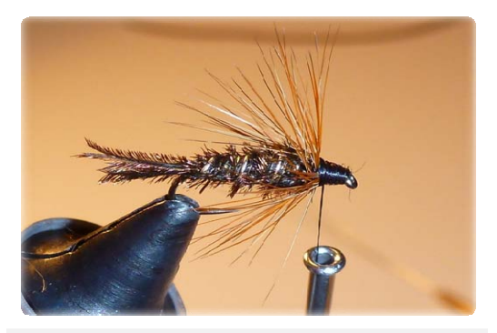
[Step 8] Spiral the wire rib forward and tie off. Make a tapered thread base from behind the eye to the front of the body. Tie in neck feather, (or similar), with the inside of feather facing the body. Fold the feather fibres to the backside of the stem in preparation for the collar. Wrap the feather a couple of times to achieve the desired effect and tie off just behind the eye. Sweep the hackle back against the body and put a few wraps around the hackle to hold feather fibres in a swept back position. (Sorry about the lack of photos through this part, but I was so engrossed in what I was doing and forgot...)