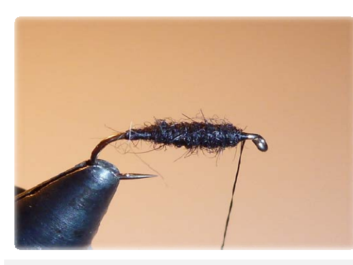
[Step 3] Dub a tapered under body as shown, this helps shape the peacock over body, (don't forget to keep the space behind the eye clear) then take the thread to the rear.