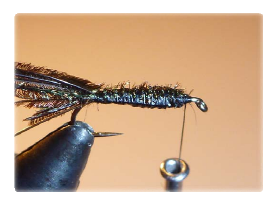
[Step 6] Tie in 4 or 5 Peacock swords / herl, (I used left overs from tail), at the front of under body and wrap tightly back to tail. Return the thread to front of under body.