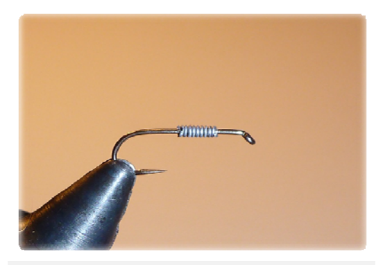
[Step 1] Wind on the desired wraps of lead, leaving a bit of room at the front of the shank behind the eye

Hook: B16, Thread: Black, Weight: Lead if desired, (helps with body shape) Underbody: Dark Dubbing, Tail: Peacock Sword, Rib: Silver Wire, Collar: Brown Hen Neck, (or in my case something I found in my scraps...) Wingcase: Dyed Mallard Flank