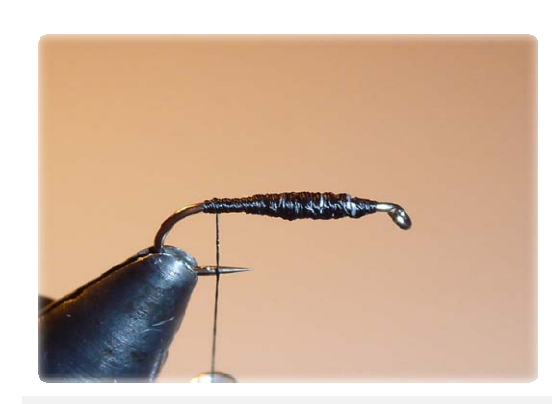
[Step 2] Trap the lead with the thread and make tapered stops at each end of the lead as shown.