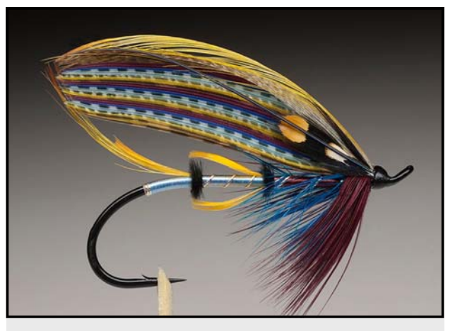
An exceptionally tied fly and very well photographed