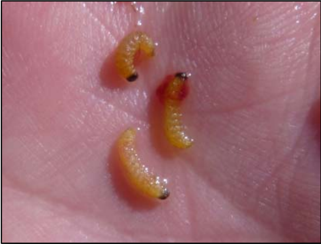
Willow grubs — How do you imitate them?