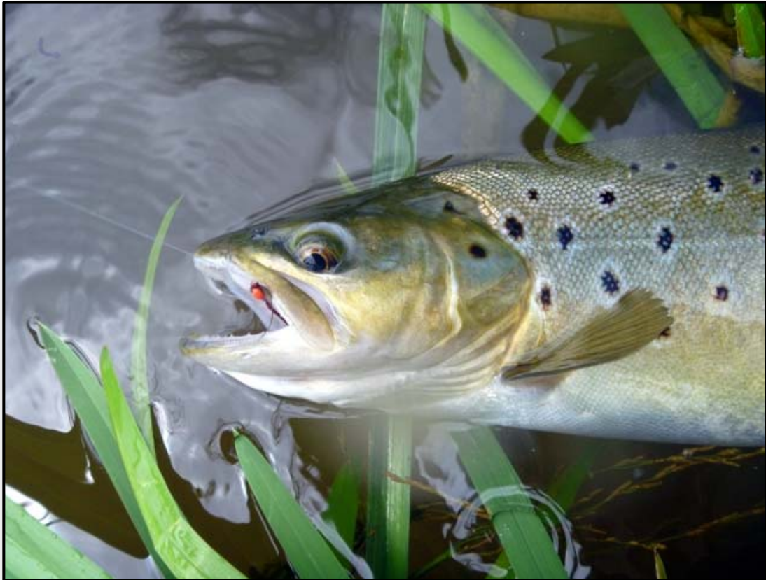
Damselfly — How do you imitate them?