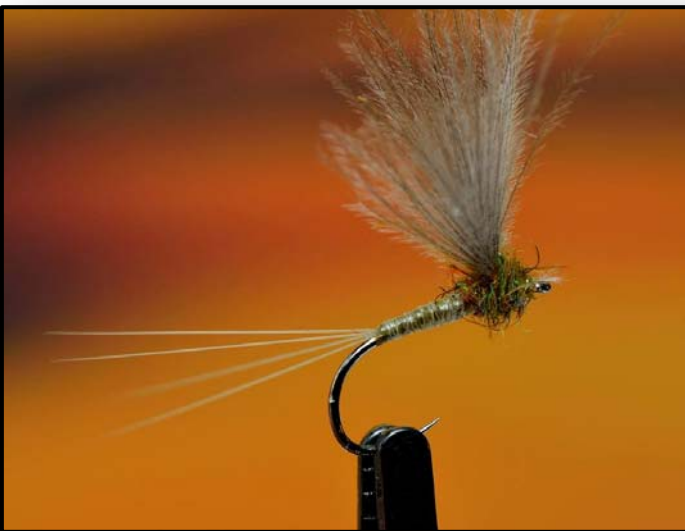
An exceptionally well tied fly and photograph