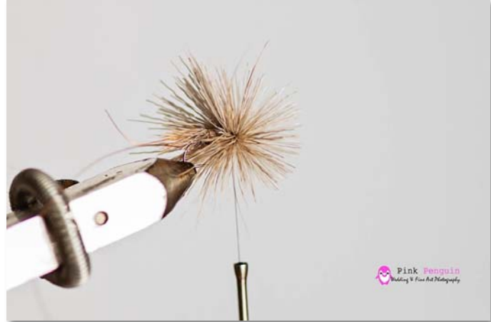
Step 4 Trim the deer hair to shape. The hair should be cut flush on the bottom to allow the fly to sit low in the water and not affect the hooking ability of the fly. Once finished trimming unwind the wire holding the wing down.