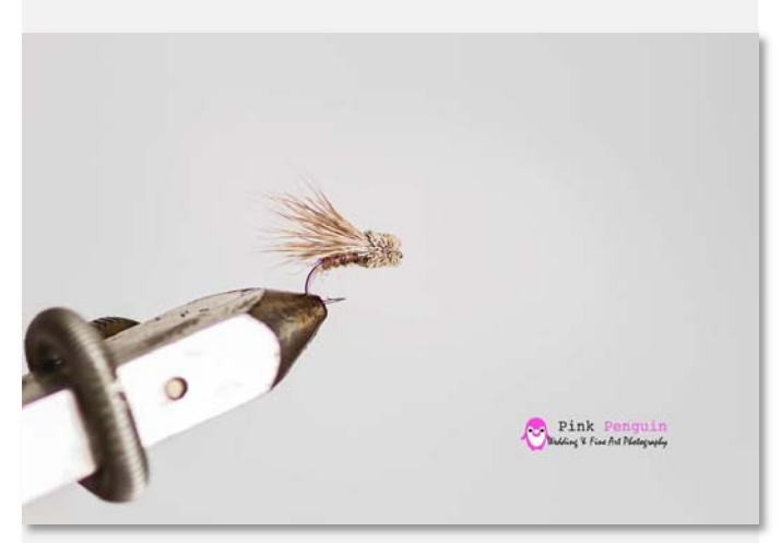
Step 3 Take another clump of deer hair and tie in front of the wing allowing it to spin around the shank. Work the thread through the spun deer, tie off behind the eye and superglue thread head.