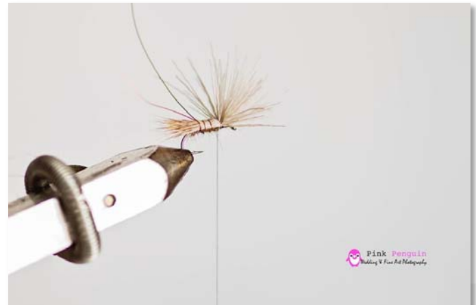
Step 2 Take a clump of deer hair, even up the tips and tie in front of the dubbing. Hold the tips to ensure they stay on the top of the dubbed body creating the wing. With a spare piece of wire tie the wing down-this will make trimming the head easier at a later stage.