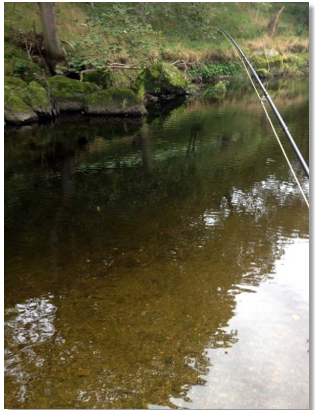
Hooked up on the Elwy