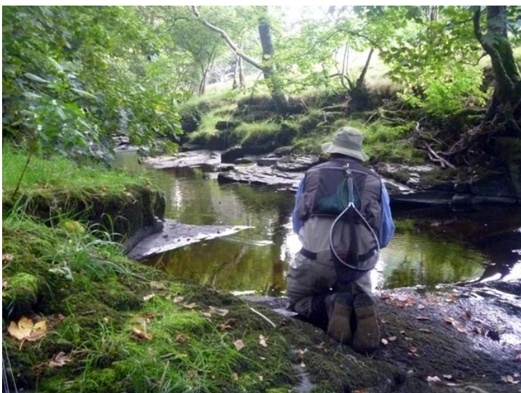
Careful stalking is required