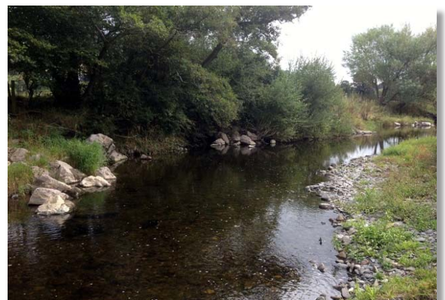
Nant Mawr beat