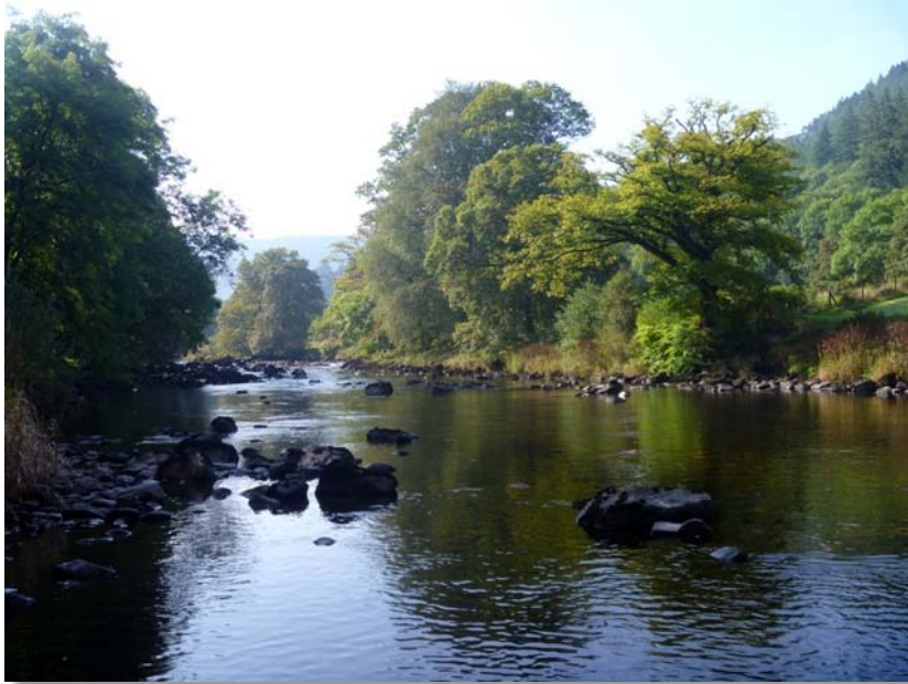
River Conwy on the Bodelwyddan beat