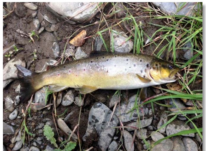
A nice fish from the Elwy