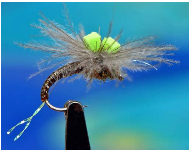
An exceptionally well tied fly and photograph