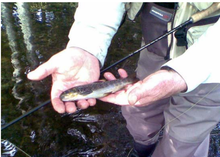
Wild brownie from the upper reaches