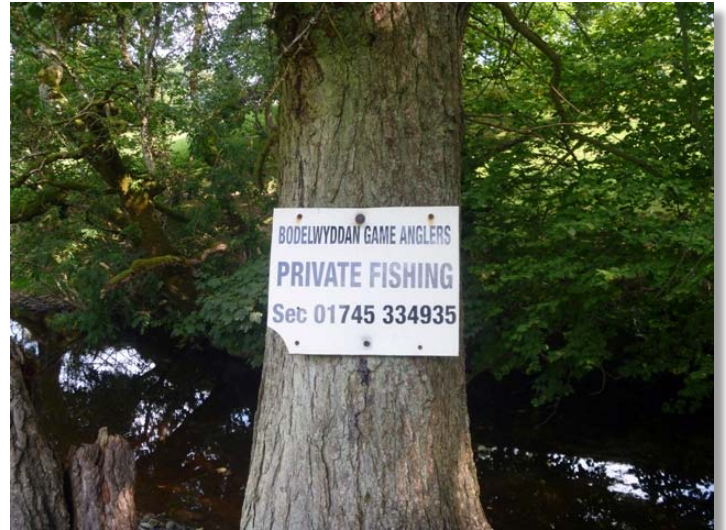
Club signage on the Cledwen

I spent a week fishing in the stunning countryside of North Wales in September on the Bodelwyddan Game Anglers waters. The club has 3 beats on the River Elwy which is a renowned sea-trout fishery, a beat of about a mile on the River Cledwen, a beat on the River Conwy for Salmon and sea-trout and fishing on a number of small lakes. A weekly permit is $50.