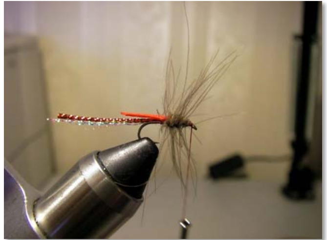
Dub the body with CDC and wind the CDC feather forward palmer hackle style