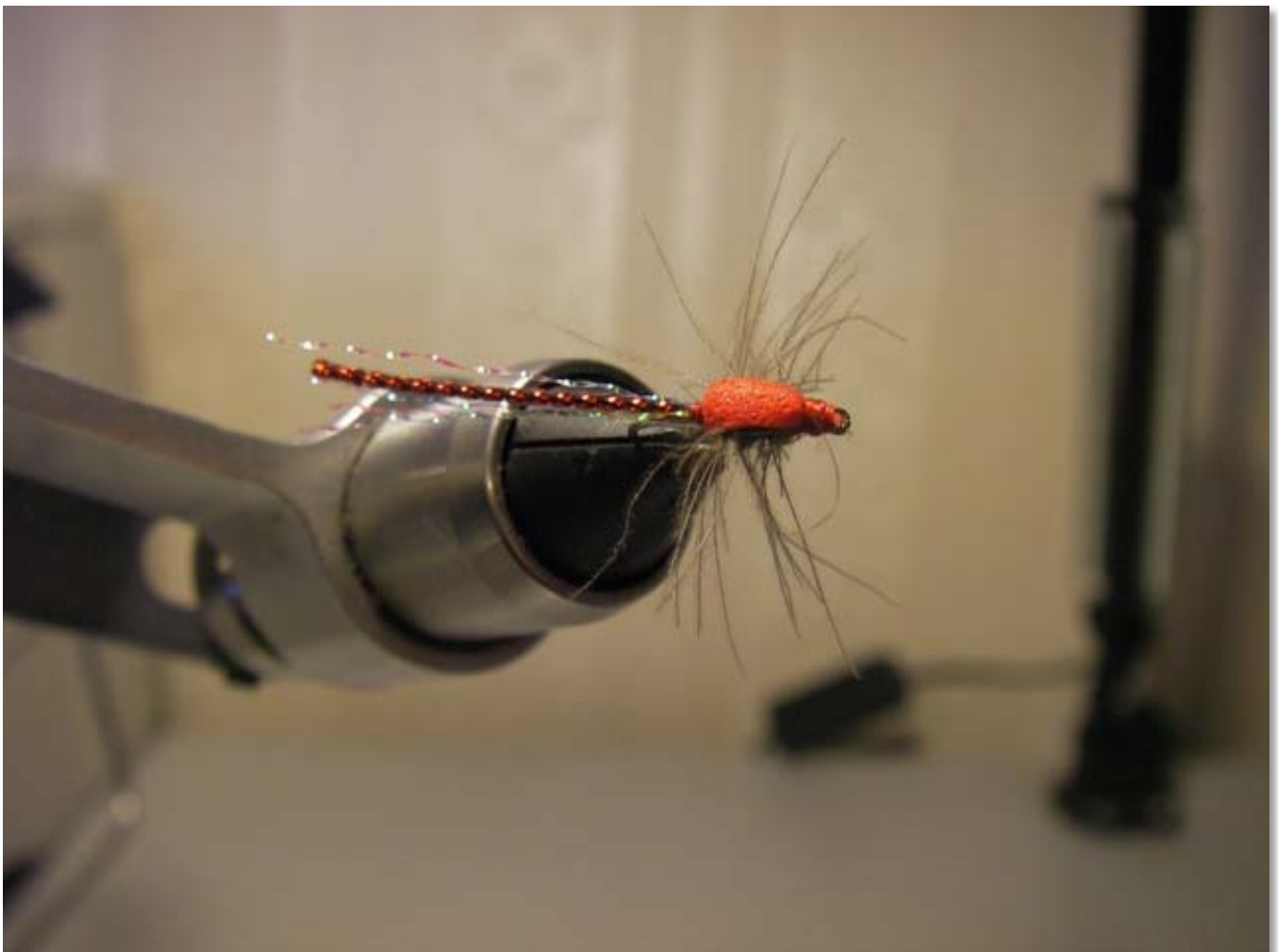
Pull the red foam over the top and tie off behind the eye and whip finish. Now trim the off the CDC that is sticking down and trim the bits sticking out the sides to form the legs..