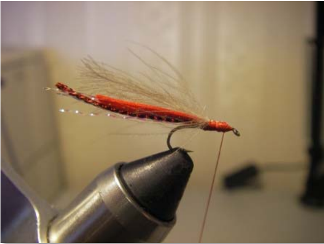
Then tie in a CDC feather suitable to wind palmer hackle style along the body