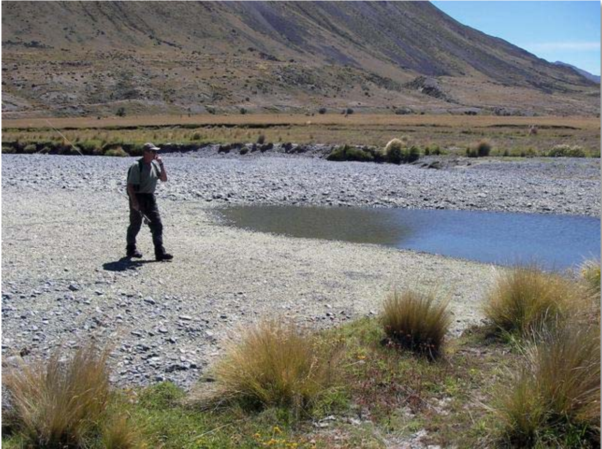
A photo of the Mararoa River above Boundary Hut where it was completely dry recently. Who stole the river?