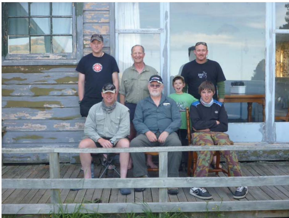
A photo from a lodge visit from February 2013