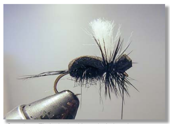
Step 6 ---- Tie in the hackle and wind on three turns, two behind the wings and one in front. Tie off hackle. Finally whip finish under the head (immediately behind the eye).