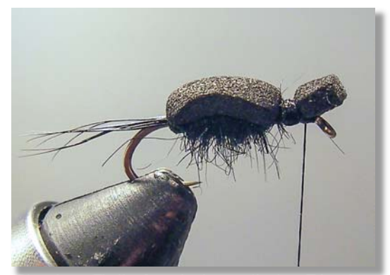
Step 4 ---- Tie the foam body over the top. Trim allowing for a short head. You may need to put a few turns of thread under the head to get it to sit up a bit.