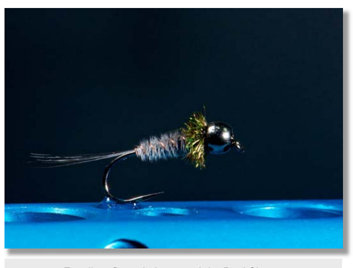
Excellent fly and photograph by Paul Slaney

"People get the Politicians and fishing tackle they deserve."