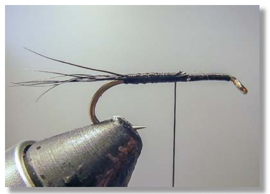
Step 1 ---- Run the thread to the bend of the hook and tie in the tail. There should be about 8-10 moose hairs in the tail.

Hook—Black Magic B12, Thread—Black 6/0 Uni-thread, Tail—Black dyed moose body hair, Body—Black 2mm foam, Abdomen—Black Ultimate dub, Wings—White poly yarn, Hackle—Black Saddle