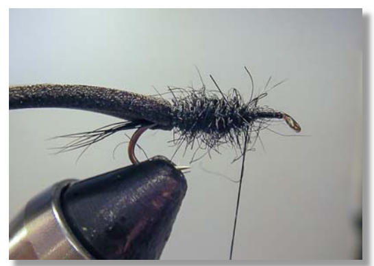
Step 3 ---- Use the dubbing to build up the abdomen. Don't go too close to the eye as you have to fit the hackle and head in front of the hackle.