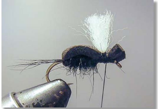
Step 5 ---- Tie in the poly yarn wings with a figure of eight on top of where the foam is tied down. Trim to length.