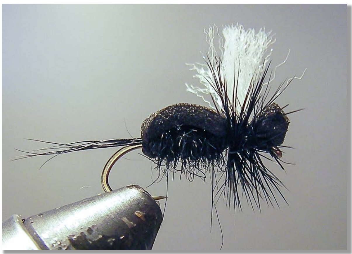
The finished fly