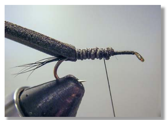
Step 2 ---- Cut a strip of foam about 5mm wide. Tie in the foam starting about 1/3 of the way down the hook. Tie in tight and go to the bend.