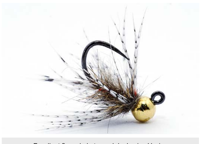
Excellent fly and photograph by Lucian Vasies