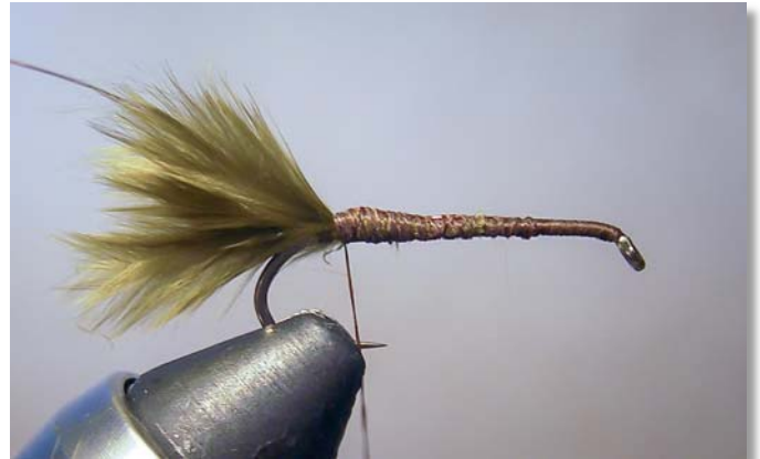
Step 2 Tie in copper wire