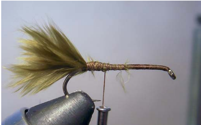
Step 1 Run thread to bend of hook and tie in tail Tear tail to length (it looks better than cutting)

Materials: Thread -Dark Brown Uni-thread 6/0 Hook -Black Magic B10 or Kamasan B830 #10 Tail -Olive Marabou Ribbing -Fine copper wire Abdomen -Olive Natural fur dubbing Thorax -Olive Natural fur dubbing Wing case - Olive Marabou