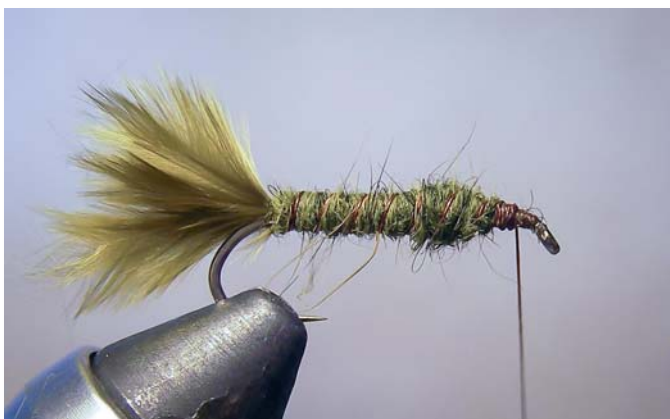
Step 5 Wind copper wire forward over both abdomen and thorax