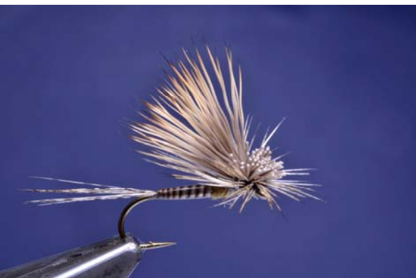
Excellent fly and photograph by Matin Westbeek

The government's proposed amendments to the National Policy Statement for Freshwater Management have already attracted considerable controversy, with environmentalists saying the government is merely trying to shift the goalposts to allow dirtier water to be classed as "swimmable."