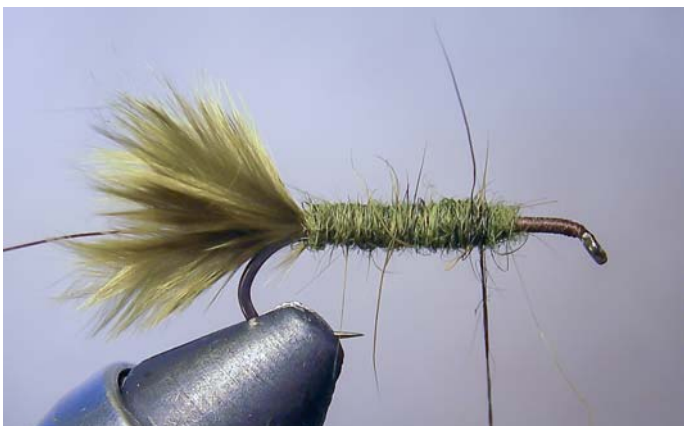
Step 3 Dub abdomen