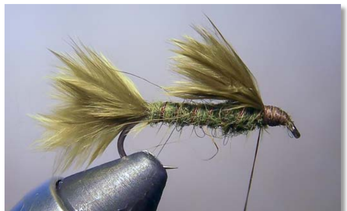
Step 6 Tie in wing case at front only. Tear wing case to length Build up head and whip finish.