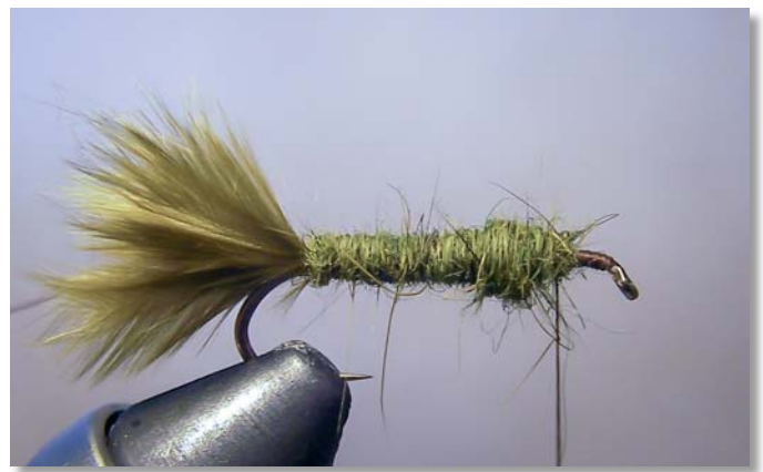
Step 4 Dub thorax ( a bit bigger diameter than abdomen)