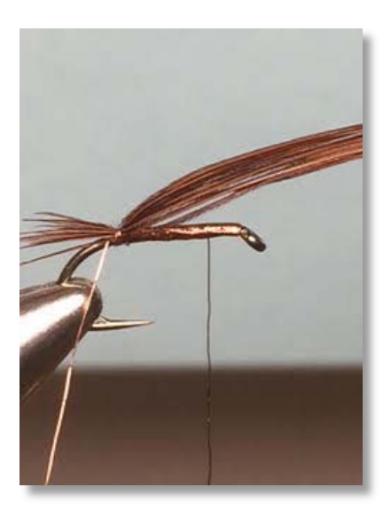
Step 2 Grab some pheasant tail material don't be stingy 8 to 10 fibers and tie in tail with 2 copper wire wraps then quickly make your way back up to the 2/3rd point and varnish or super glue the copper. (Copper on copper will slip otherwise)