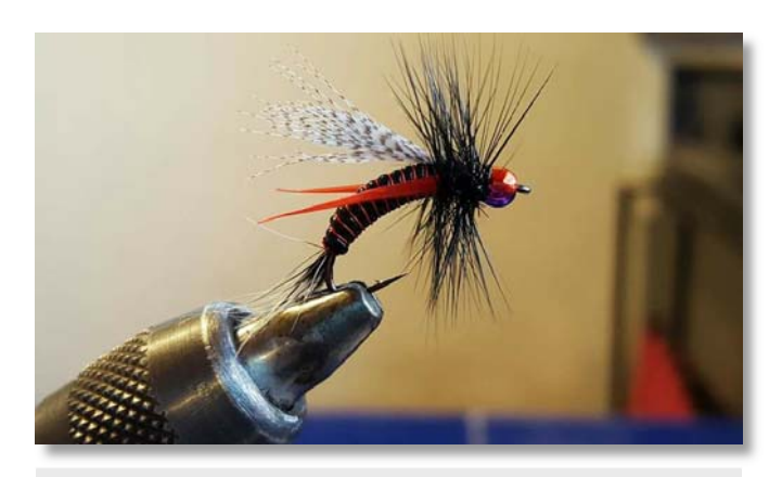
Excellent fly and

"People get the Politicians and fishing tackle they deserve."