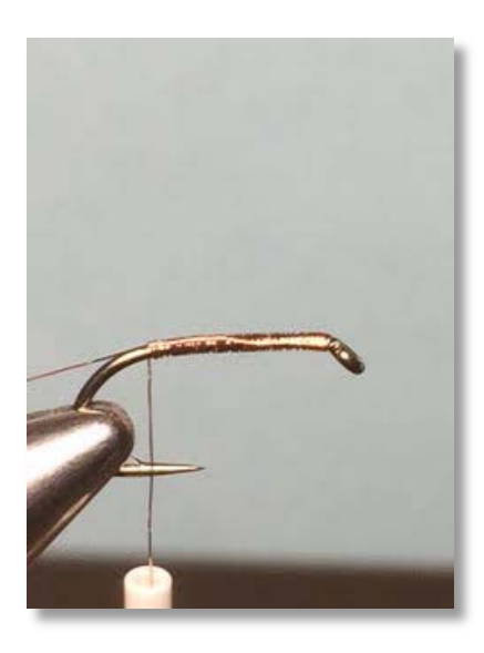
Step 1 Tie in the copper wire down the shank of the hook to the barb. Touching turns. Keep your waste piece

Materials: Hook. Size 12 Kamazan b175 or similar. Thread. Copper wire med or small Body. Natural pheasant tail