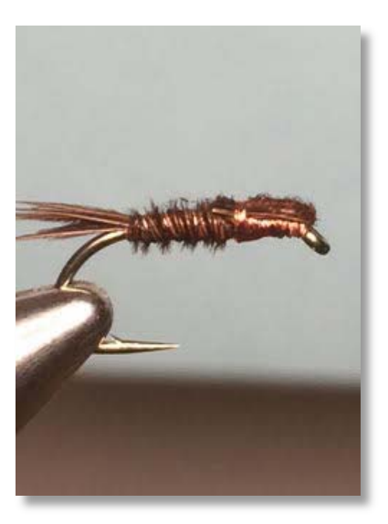
Step 5 With the pheasant tail material on the top of the hook wind the copper wire up to the eye of the hook and start to build up the head (don't go crazy) making your way back down to the 2/3rd point. Pull the pheasant tail material over the head use your thumb nail to straighten all the fibers and secure with 1 copper wire wrap. Still keeping the copper wire tight whip finish 3× making your way forward, trim the pheasant tail material leaving a couple of millimetres. This imitates the wing buds.