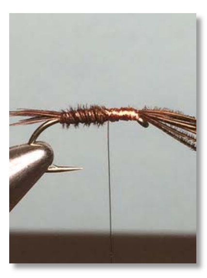
Step 3 wind your pheasant tail material the opposite way you wound your copper wire up to the 2/3rd point and secure with 1 copper wire wrap. Then varnish or super glue will help hold it in place (your pheasant tail material should be on the top of the hook)