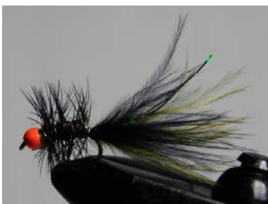
The finished item

Tie in the body hackle at the front and wind back approx. 4 turns. Tie off hackle with the copper wire and run it forward as a rib. Approx. 4 turns through the feather and tie off. That's it.