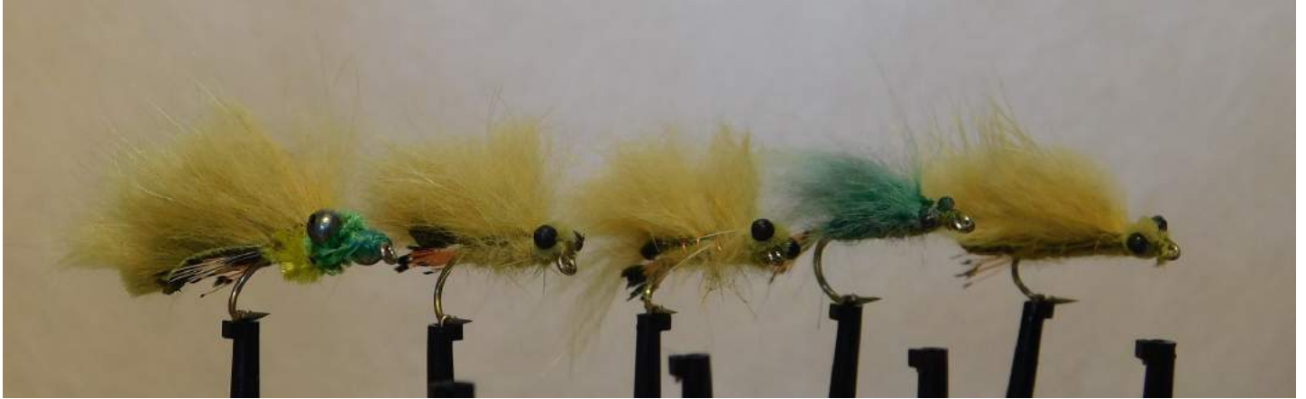
July fly competition entries