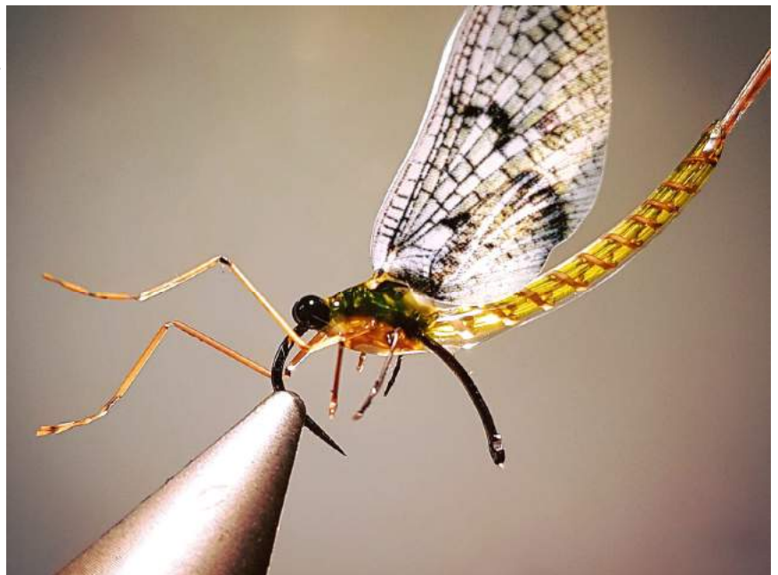
Cover Photo August Fly Tying Day

"It has been too timid and avoided the hard issues it is supposed to be there to tackle."