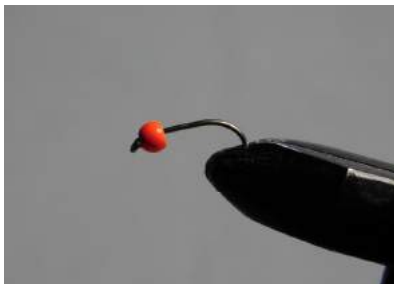
Orange bead on hook