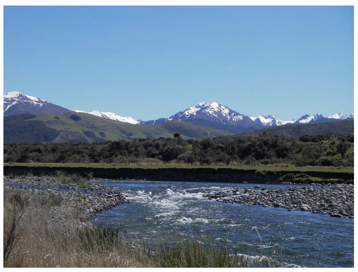
Below - Winner Scenic section