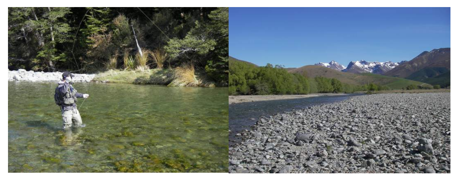
Hooked up on an early season trophy.

Just a couple of early season photos to get you thinking about the up coming season.