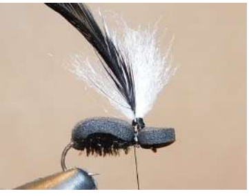
Tie the hackle on to the post sticking straight up.