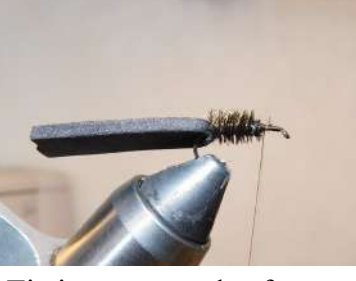
Tie in two strands of peacock herl and wind forward to cover the tied down foam