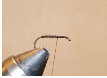
Run the thread to the bend of the hook and then back two thirds of the way to the eye.

Black Magic E12 Unithread black 6/0 Peacock herl Black 2mm foam White poly yarn Black saddle hackle.