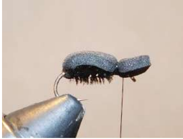
Pull the foam back over the peacock herl and tie off. Trim the foam so it sticks out just past the eye of the hook and wind a few turns under the loose piece of foam to lift it off the eye.

Wind three or four turns of the hackle down the post and tie off. Whip finish around the post under the hackle and trim thread and hackle.