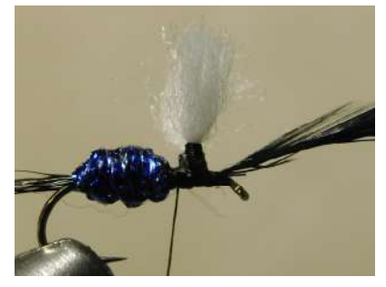
Tie in the hackle. I tie in my hackles out over the eye of the hook like this and run the thread back to the front of the abdomen.