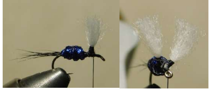
Tie the poly yarn on top of the hook and form two wings. Secure with figure 8 binding.

Tie in the blue string. Then build up the body a bit with black floss or something similar and wind the blue string forward to form the body. Try and get it a bit neater than this.