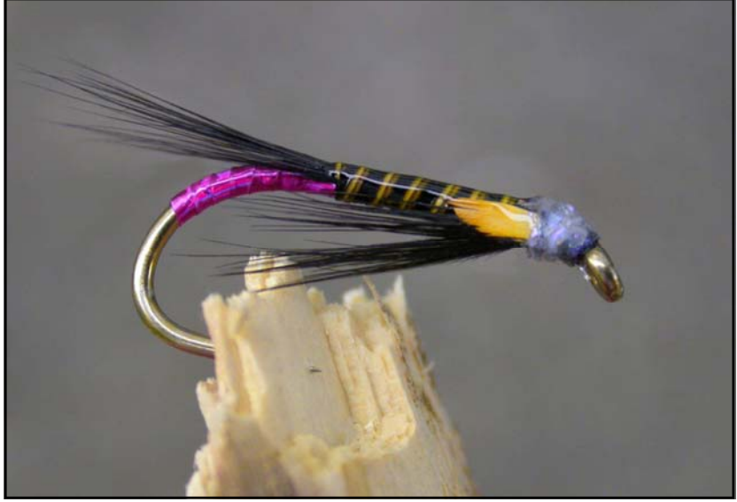
An exceptional fly and very well photographed