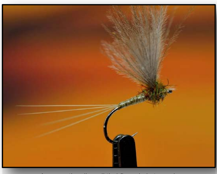
An exceptionally well tied fly and photograph