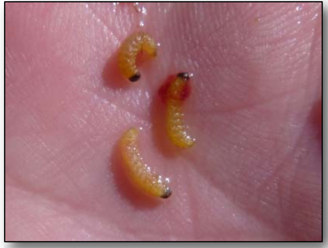
Willow grubs — How do you initate them?