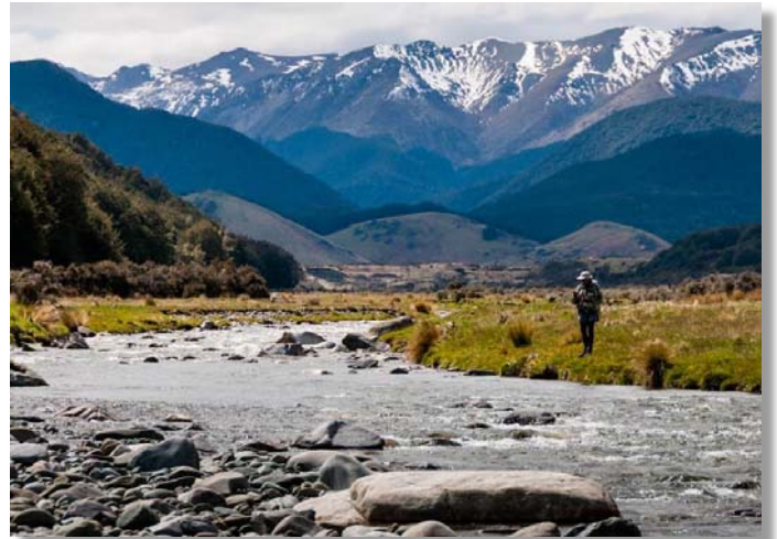
Action Photo winner— Les Ladbrook