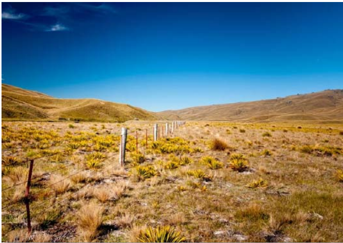
Scenic Photo winner— Les Ladbrook