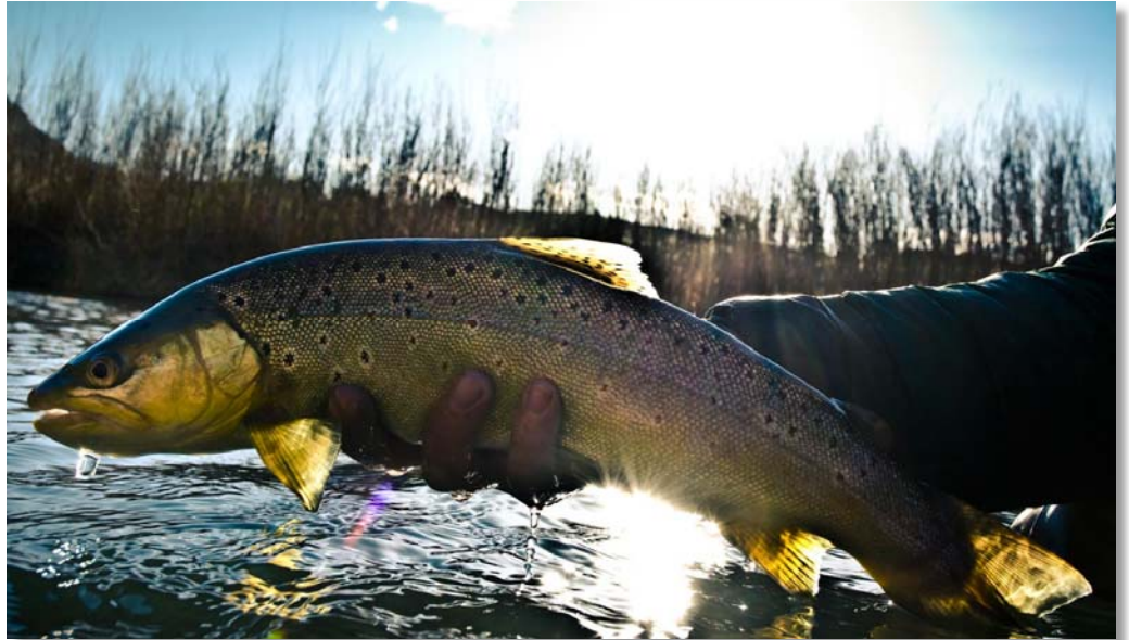
Fly fishing with stealth is one of the best ways to increase your catch rate.

How often do you think anglers miss opportunities catching trout because of the lack of stealth? The more educated trout populations are in a stream, river or lake you're fly fishing, the more important it is for fly anglers to mimic the way a hunter stalks game in the field. I estimate that I give away upwards of 50% of my trout catching opportunities due to my lack of stealth. Below are 8 common mistakes fly anglers make on the water that blow their cover and success.