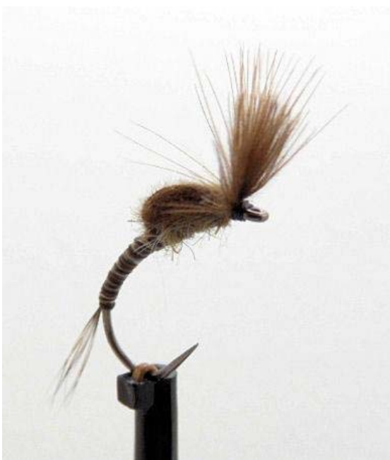
An exceptionally well tied fly and photograph