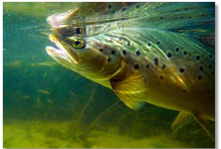
Trophy Photo winner— Johnny Mauchline