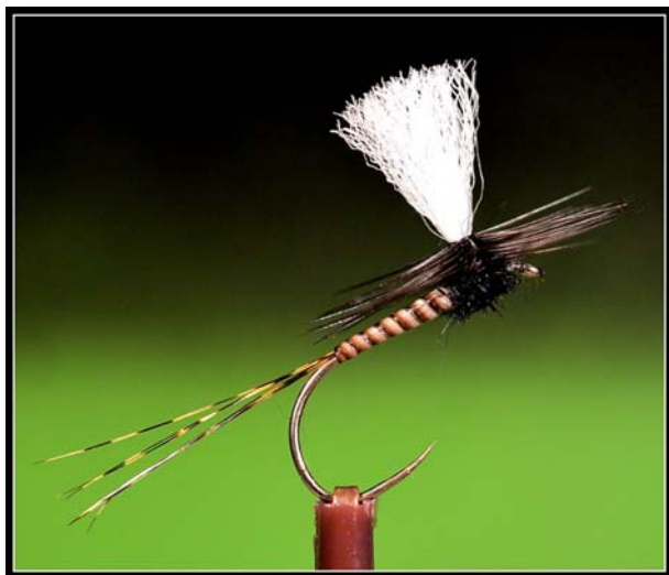
Exceptionally well tied fly and photograph