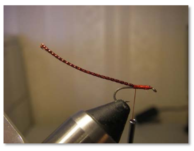
Tie in the red braid abdomen letting it curve up from the hook. It should be about 25 to 30 mm beyond the end of the binding.