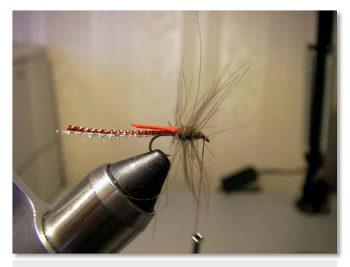
Dub the body with CDC and wind the CDC feather forward palmer hackle style