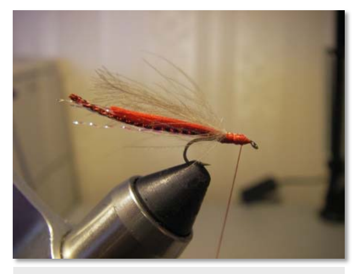
Then tie in a CDC feather suitable to wind palmer hackle style along the body