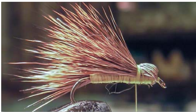
Step 3 ---- Draw wing back over the top of the body and tie thread round off about a quarter along the hook to form the head. Wing should stand straight above the end of the tail.