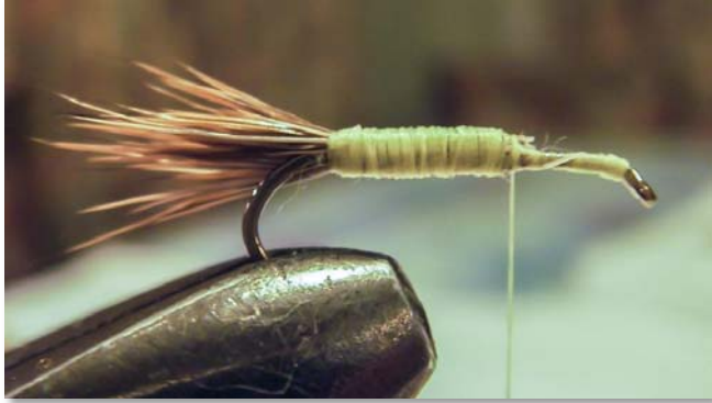
Step 1 ---- Tie in Deer Hair Tail and Body

The Madame X is a useful hopper or cicada pattern without having to trim deer. So far this season it has worked on both small and large streams. I will demonstrate it at the April meeting.