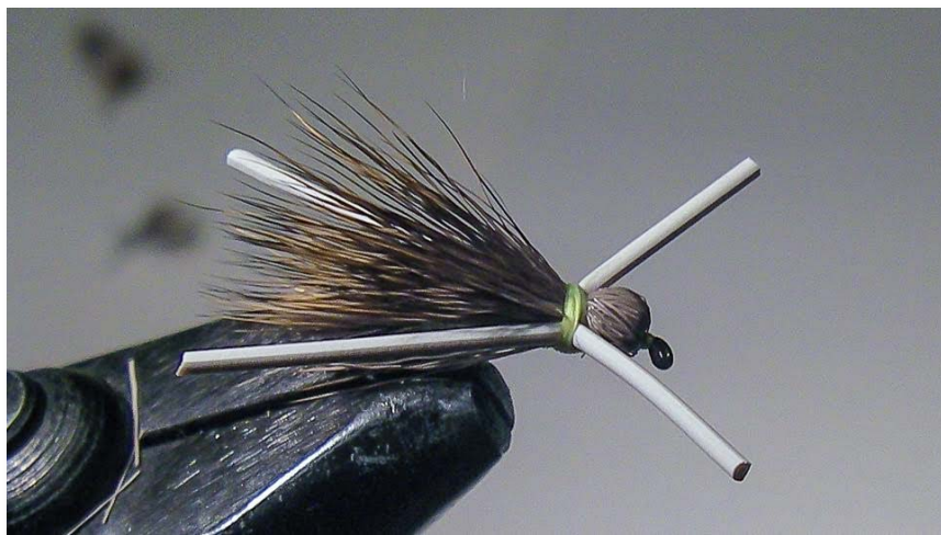
Step 5 ---- Whip finish