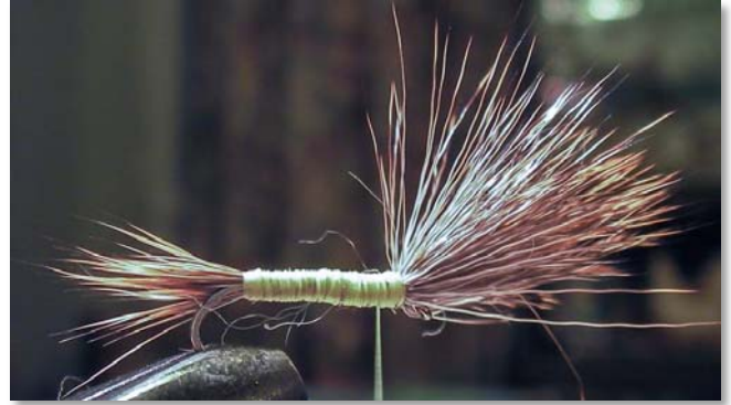
Step 2 ---- Tie in Deer Hair Wing with tips sticking out over the eye of the hook