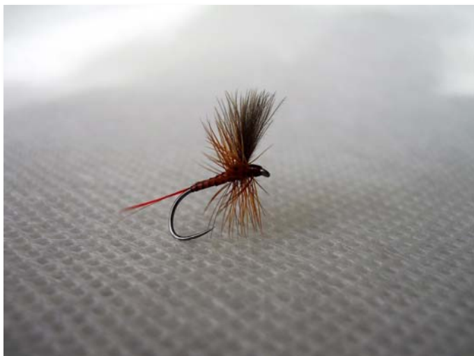
Excellent fly and photograph by Wlodzimierz Janowicz