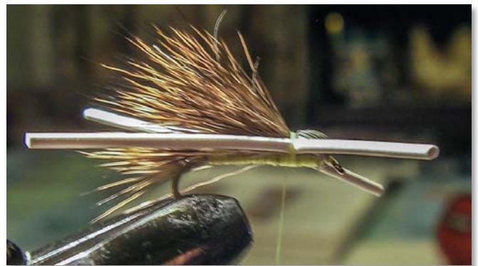
Step 4 ---- Tie rubber legs in where the head is formed.