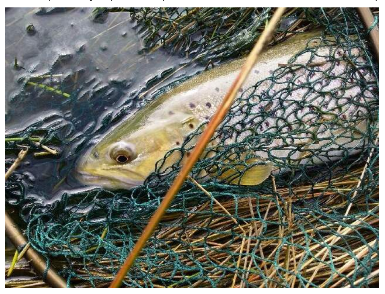
One of Chris's browns from Te Waewae Lagoon

It was a good day out, the cloud pretty much lifted apart from a 2 minute shower after lunch. The lagoon was reasonably clear. Fish were able to be spotted especially when the sun was out. It was nice to have newbies Dayne and Murray on the trip. Dayne had a busy club weekend involved with club activities on both days.