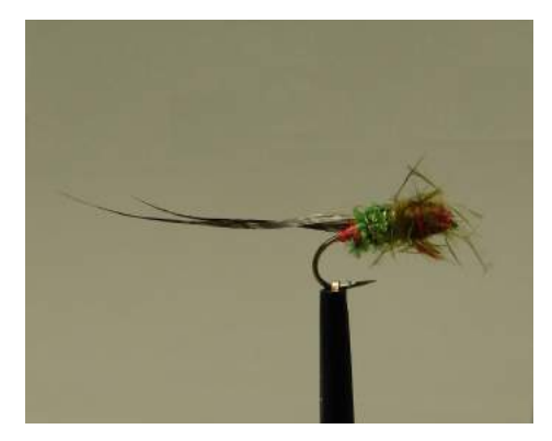
Other Spotlight flies