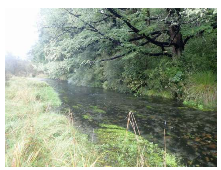
1st Equal Scenic Section - Julie Cook