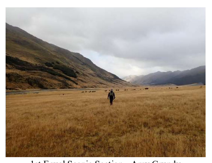
1st Equal Scenic Section - Amy Grundy