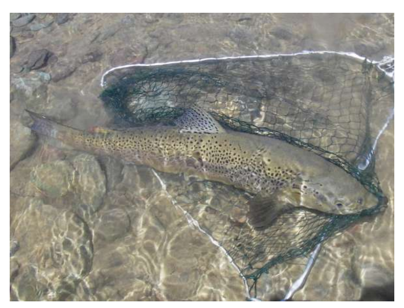
A nice brown from the Mararoa above North Mavora Lake.

Sunday, we decided to fish the edge of the lake. As the southerly breeze was still blowing, we headed across to the north side of the West Burn delta where it would be an off-shore breeze, hopefully blowing insects out on to the lake. As we were setting up I spotted a couple of fish just along from the shore. I saw one of the fish race after something in the water and advised Julie that a woolly bugger might be worth a try. As I watched the other fish it swam straight towards me. I still had a royal wulff on from the previous day so cast that just on my side of the fish. It rose up and took the fly without hesitation. It is generally difficult to spot fish around the edge of the lake so normal procedure is to cast a dry out to the drop off and wait for the fish to take it. This worked reasonably well and we had landed five fish by the end of the day. We headed back to find we had the hut to ourselves for the night.