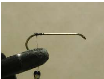
Step 1 Tie on thread at rear of hook