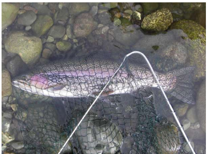
A nice Te Anau Basin rainbow

The first trip was an upstream trip on the lower river as I hadn't found any fish further up on the April mid-week trip so decided to fish further down. I spotted a few fish straight away but they weren't co-operating. By the colour of the fish I was pretty sure these were lake fish coming up to spawn and these are often hard to tempt as they have their minds on other things. I did finally get one to take so at least I wasn't going to have a blank day. Just after I stopped for lunch, I spotted a fish in reasonably fast water. It was pretty keen and soon came to the net as did another a little further up the river. These fish looked to be resident fish and were clearly feeding. I walked quite a bit further up without spotting any more fish, even in some good pools. It was quite a long walk back to the car at the end of the day.