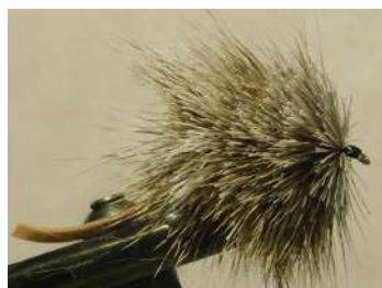
Step 5 Repeat step 4 until almost at the eye of the hook. Form head and tie off with a whip finish