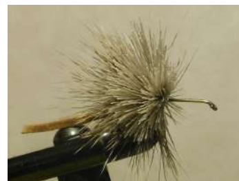
Step 4 Tie in another clump of deer hair. This time push down on the deer hair while pulling the thread tight. This should cause the hair to spin evenly around the hook. Push the hair back towards the tail. Take two turns of thread against the hair.