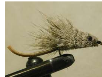
Step 6 Remove fly from vice and hold it over an empty cardboard box or empty 2 litre ice cream container. Trim deer hair to shape. Hopefully the cut off hair will land in the box and simplify your clean up. Use black Sharpe pen to make eyes.