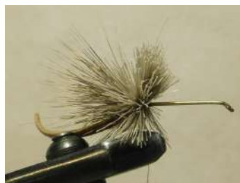
Step 3 Cut clump of deer hair, Remove waste from bottom of clump. Hold clump above hook where the tail is tied with tips facing the tail. Tie in with two loose turns then pull thread tight while still holding the clump tight on the hook. Hopefully the end of the butts will flare but not spin all round the hook. Tie thread through the flared butts to tie in. Push the butts back towards the tail. Take two turns of thread against the deer hair.