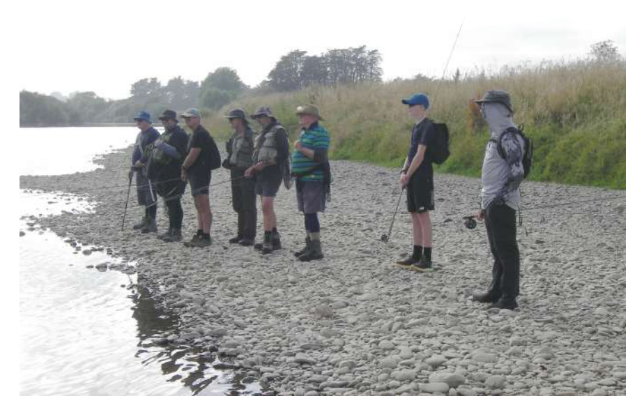
On the river, Sunday morning

We all had a good weekend just a pity about the number of participants.