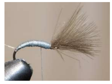
Build up a tapered abdomen with the tying thread.