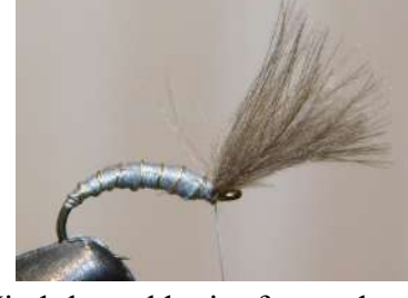
Wind the gold wire forward and tie off. Put a couple of wraps of thread in front of the wing so it stands up about 45° and then whip finish.