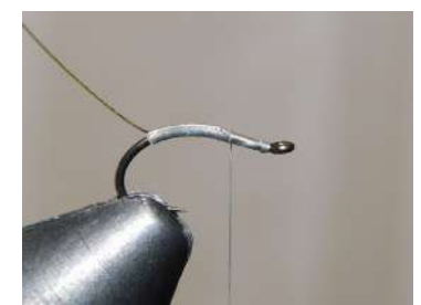
Tie in the gold wire.