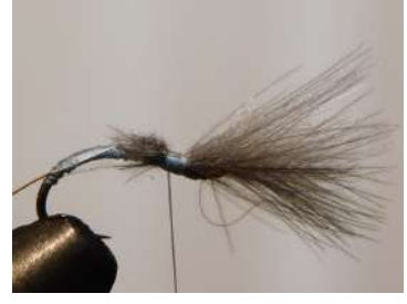
Trim the cdc feathers along the hook. Try and get this sloping down to the hook. This will help build up the body.