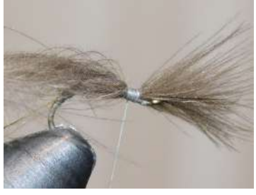
Carefully line up three cdc feathers so their tops are even and tie in about 2mm from the eye.