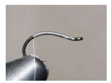
Run the thread down the hook.

Hook Black Magic F16 Thread Unithread gray 8/0 Ribbing Fine gold wire Wing CDC feathers