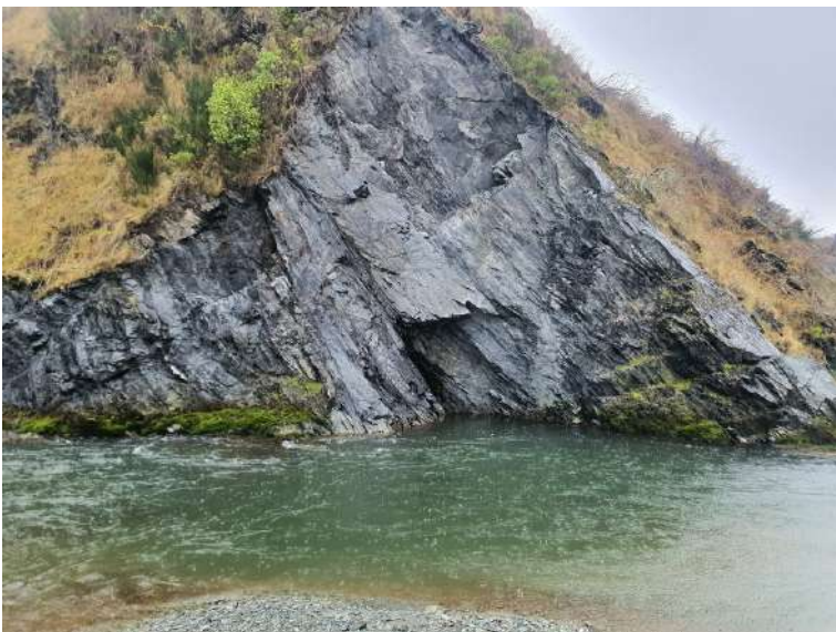
Rain falling in the Von River lower gorge

We drove up to the old homestead and after eating lunch we headed across to the river. We spotted fish almost immediately but I was the only one that managed to hook one of these. One of the fish looked to be a good size but it wasn't interested in anything we offered it. When we reached a place where two branches of the river came together, Keith headed up one branch while Isaac and I headed up the other. We soon spotted a fish and it took Isaac's nymph and came to the net. A little further up I spotted another fish but an old tree on the edge made it difficult. From below the tree I couldn't see the fish and from above I was going to spook it. Finally I was able to figure out where it was from below the tree and it came to the net. Keith didn't see anything on the other branch. We spotted a couple more fish and it was Keith's turn to cast to sighted fish. The fish were moving up and he managed to get his flies caught in his clothing and by the time he was untangled the fish had gone.